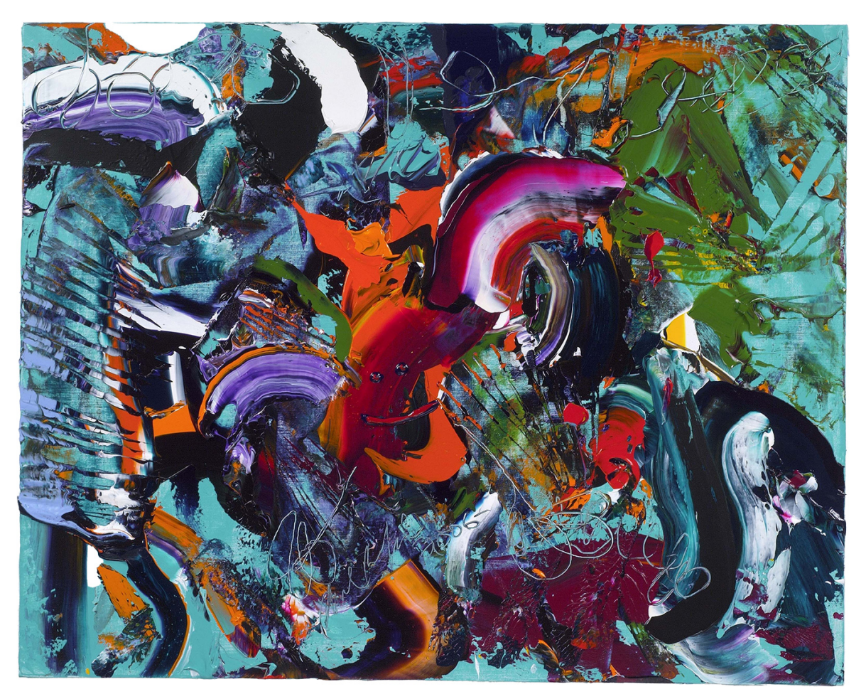
"Floating", 2007, acrylic on linen, 35 x 44 in