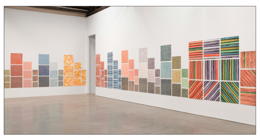
Jennifer Bartlett, Recitative (detail), 2010, enamel over silk-screen grid on baked enamel and steel plates, 11' 2'' x 158' 3'', overall installed, 372 plates. Pace.

In Michael Reafsnyder's joyously frenzied paintings, each rectangular picture, with its layers of drips, swirls, daubs, and arcs, in every hue imaginable, was also a map of its own creation. Together with his cacophonous multicolored, biomorphic ceramic sculptures, these works