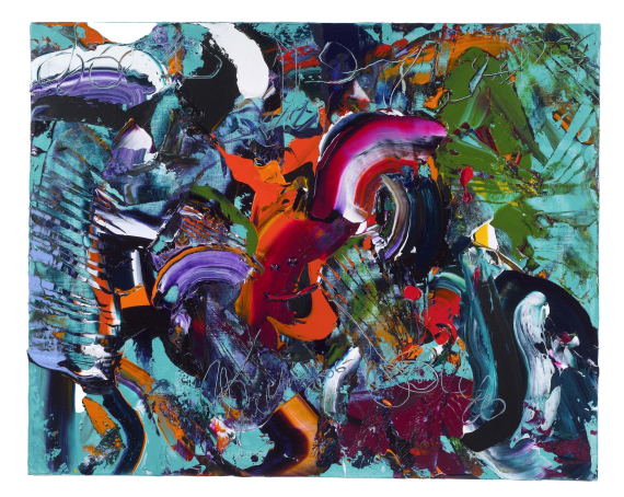
"Floating", 2007, acrylic on linen, 35 x 44 in

Garish, silly, whimsical and satirical, aptly describe Michael Reafsnyder's paintings, and these are terms that no self-respecting mid-twentieth century abstract expressionist painter would accept. But Reafsnyder's paintings exist for the pure joy of being abstract except that it isn't a familiar type of abstraction; they are a very twenty-first century twist on modern American art.