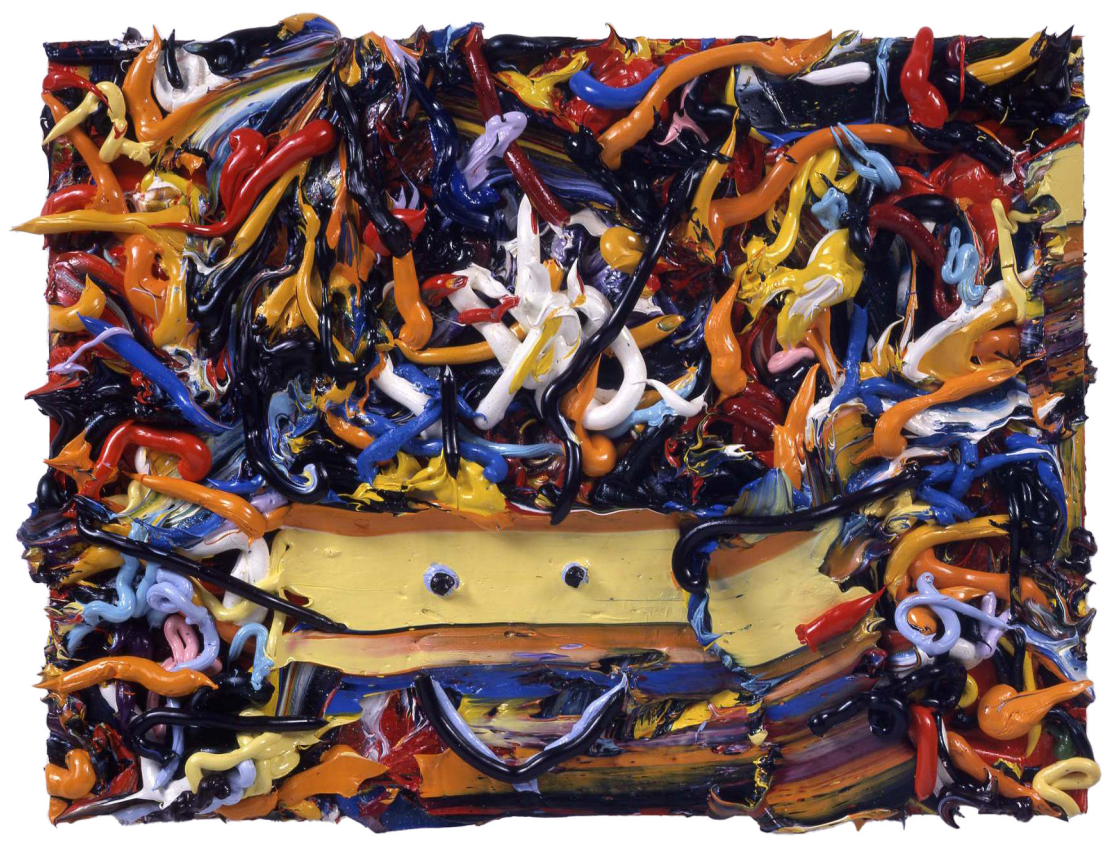
Michael Reafsnyder, Drink Milk, 2002, oil on panel, 12 x 16 inches

aatter Sf paisf to lifa with less apparent spääläe äha.."ä Täös saalian.