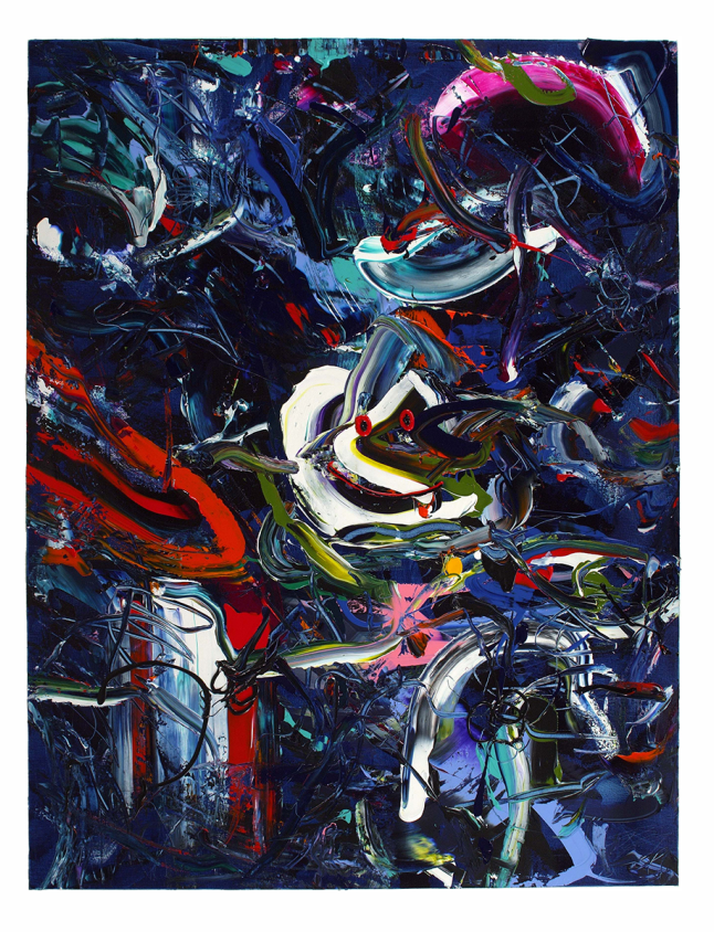
Fluttering, 2006, Acrylic on linen, 94 x 72 inches

Michael Reafsnyder: Aqualala New Paintings, Drawings, Sculpture